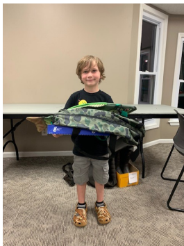
One of the Raffle Winners