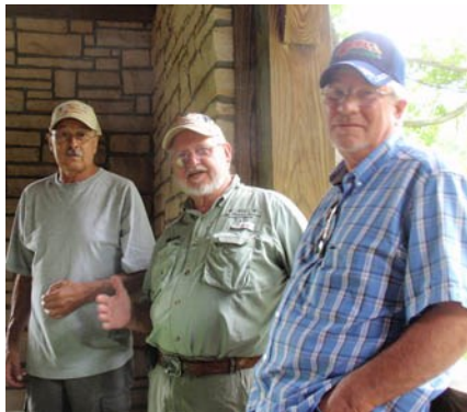
(Roaring River Derby)

I will get a complete calendar for the remainder of the year out soon. So come join us.