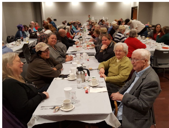
(Lunker Dinner -2020)