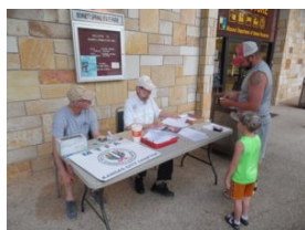
Working the Sign In Table

There were 143 anglers registered for this years derby. We were lucky to get the derby in due to the weather conditions. This year we had a luncheon, raffle and business meeting instead of conducting everything during the dinner hour. Hope you will plan on attending next years derby.