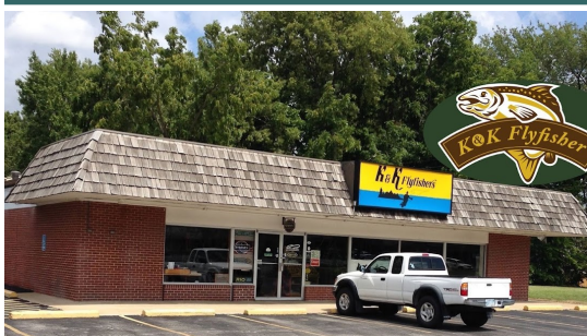
Chalhuaquen Lodge Patagonia (Jan 6-13, 2024) $4900.00 + VAT

Estancia Tecka (Jan 10-16, 2024) $3650.00 + VAT