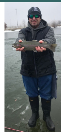
Winter Trout Fishing at Area Lakes

February 20 - 5:00pm at Rainbow Fly Shop (Bring your fly tying equipment. There will be some kits available)