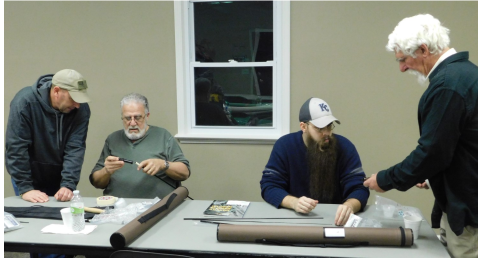
Experienced rod builders share their experience by mentoring participants who are new to the craft as the annual PHWFF rod building competition gets underway.

Participants will compete in three categories: Beginners, building their first rod; Intermediate, building their second or third rod; and Advanced, having built three or more rods. Rods must be completed