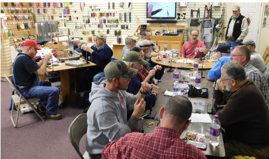
Regular monthly fly tying sessions will continue at Rainbow Fly Shop (above) and Fleming Hall, in addition to the rod building sessions on Mondays.

Winners of each category will also participate in a two-day fishing outing in the Great Smoky Mountains, immediately following the conclusion of the Exposition.