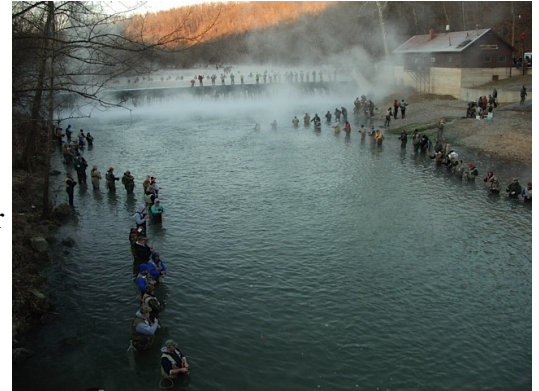
It won't be long - Opening Day

Bennett Springs is considered our home water but our club members also travel to Roaring River and Taneycomo.