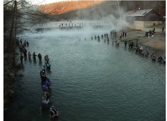
It won't be long - Opening Day

Put the date on your calendar and plan to attend our dinner which will be catered at the Disabled American Veterans (DAV) building located at 14605 E 40 Hwy., Kansas City, MO. The cost to members and their guests will be $5.00 per person. If you are a Project Healing Waters Fly Fishing participate your cost is being covered.