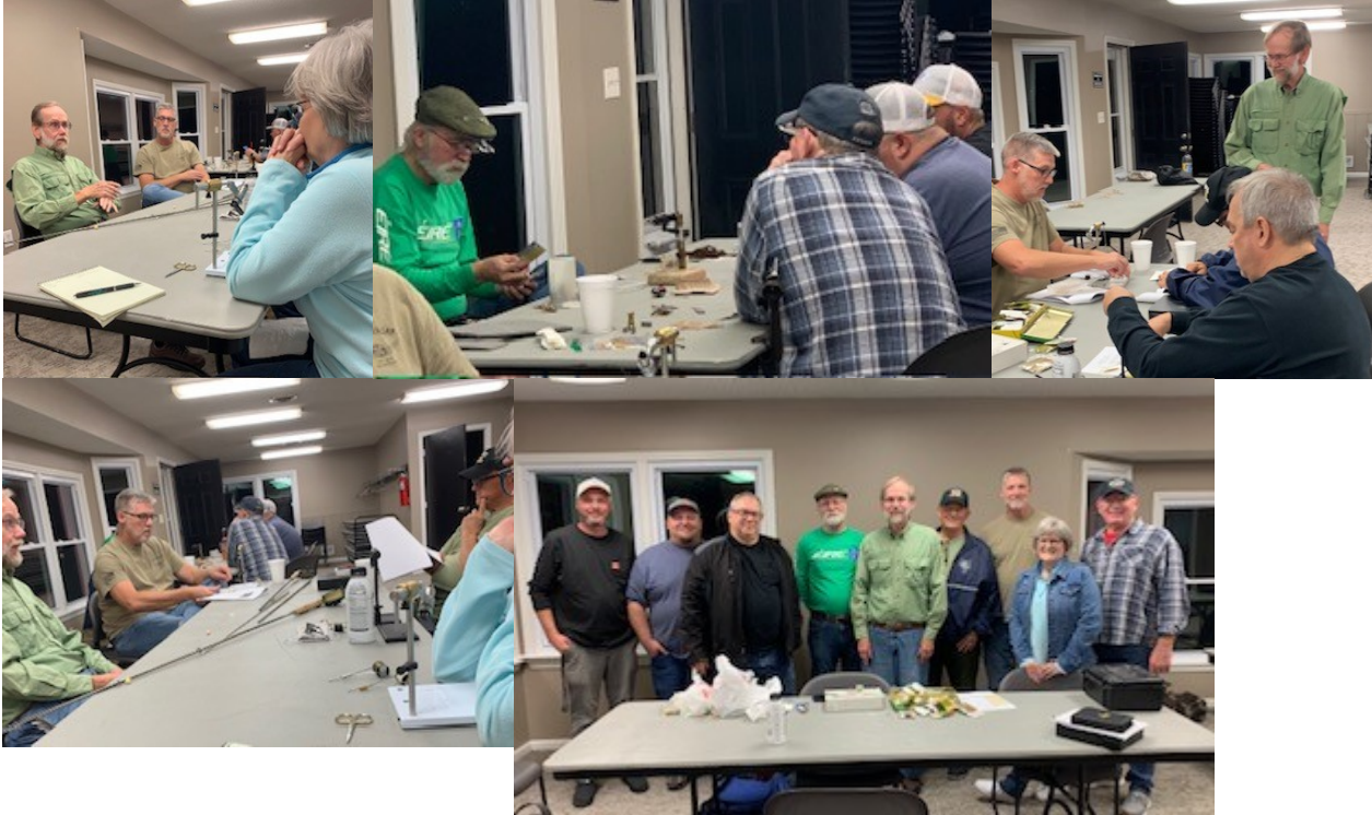
Last class attendees