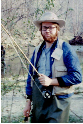
Spring 1976 at Montauk State Park Downstream of the Blue Hole