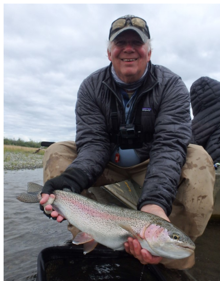
Alaska is Awesome!!!!

We have had a lot of rain this year and we should be in for a very nice fall and the colors of the trees should be spectacular, but winter is just around the corner. As far as I am concerned it can stay away for about another three months. Catch and Release season at Bennett Springs is one of my favorite times of the year. Great place and time to take grandchildren. Winter time is when I take inventory of my fly gear. I check my fly hooks for sharpness and rust, make a list of what I need to tie to replenish what I lost or gave away. Also, it is a good time to clean, inspect, and dress your fly lines.