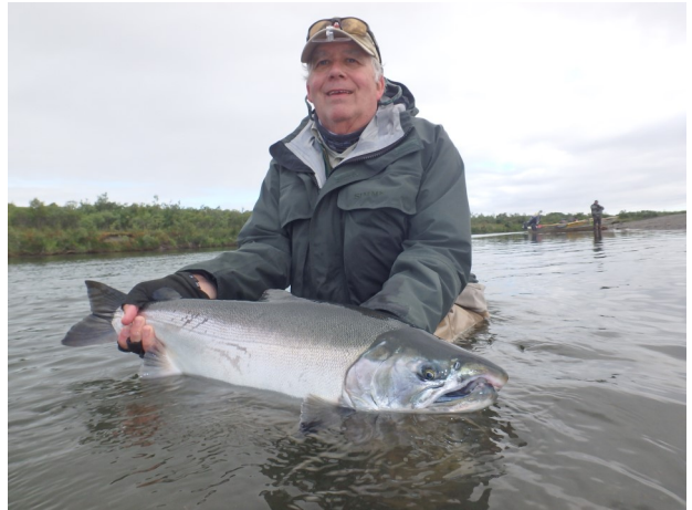
Alaska is Awesome!!!!

We have had a very nice fall and the colors of the trees have been spectacular, but winter is just around the corner. As far as I am concerned it can stay away for about another three months. Winter time is when I take inventory of my fly gear. Check my fly hooks for sharpness and rust, make a list of what I need to tie to replenish what I lost or gave away. Also, it is a great time to clean, inspect, and dress your fly lines.