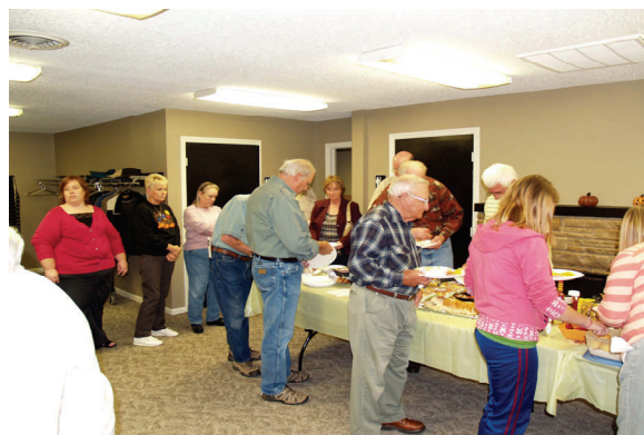
The Chow Line