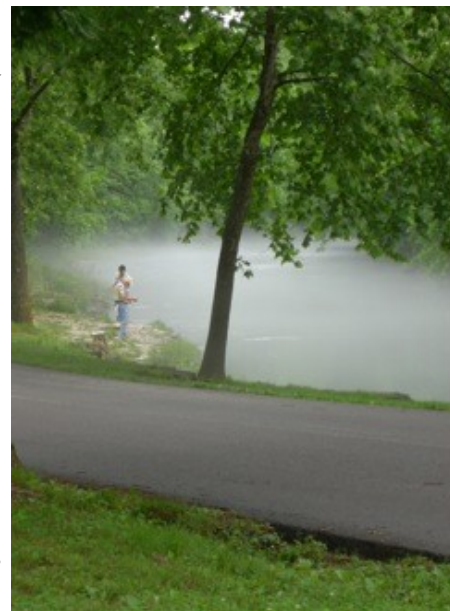
From Weavers Fishing Report