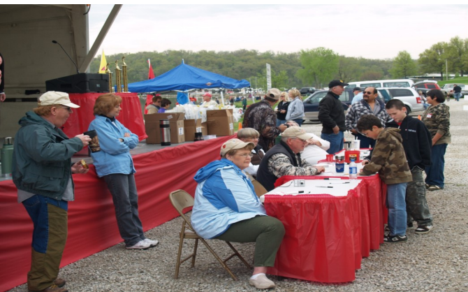
MTFA / Jackson Co Parks & Rec's - Kid Derby at Lake Jacomo