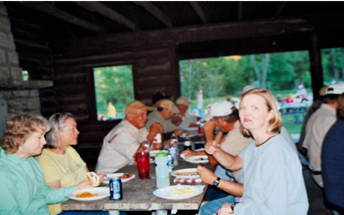
MTFA Fall Derby at Roaring River

Here are some photos from this past years activities. I hope to see you in some of the 2010 club photos.