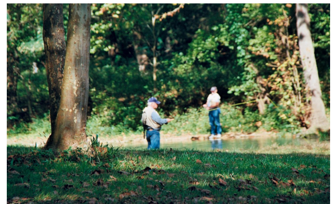
MTFA Club Outing