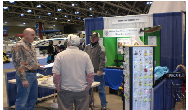
Sport Show 2010

I want to thank everyone who worked so hard to make the Sports Show a success. Those who tied jigs and flies, packaged them, and others who worked at the show. A big THANK YOU! Our location this year was not the best, hopefully next year we will be in a different location with more exposure.