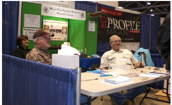
Sport Show 2010 at Bartle Hall