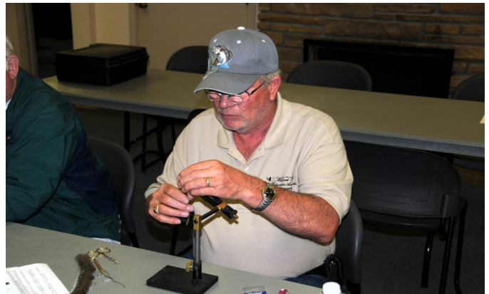
Fly Tying Class at Fleming Hall