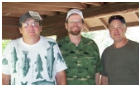
2007 Derby Winnders